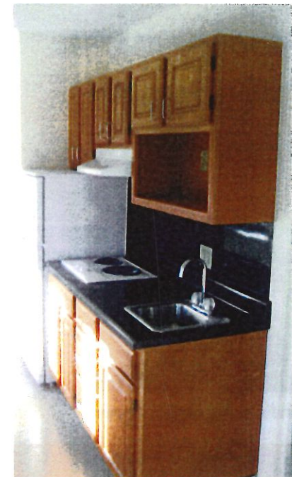
Typical Apartment Kitchenette

Also included in the building is a community room & kitchen for parties and other gatherings by the residents. A laundry room is available for residents as well as private offices which are available for use by service providers with clients in the building