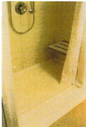
Handicap Accessible Shower