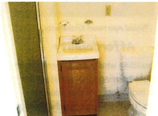
Typical Bathroom with shower